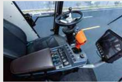
Cab Control System