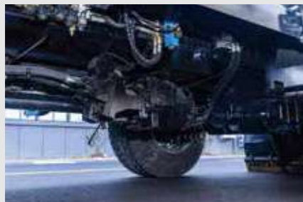
Hydraulic Motor & Gearbox System