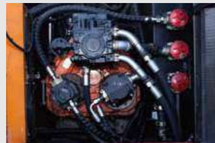
Transfer Case & Hydraulic Pump Assembly